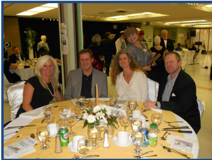
Titanic Fundraising Dinner, April 28, 2012 (above) 23 rd Annual Walk of Ages, June 11, 2011 (below)