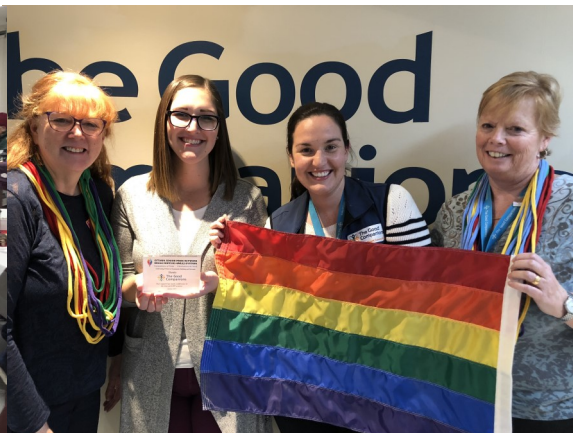
The Good Companions was honoured and proud to accept an award for 10 years of Community Building & Outreach from Ottawa Senior Pride Network at the Visibility in Action Forum. We look forward to our continued partnership and providing inclusive programs and services to LGBTQ2 seniors.