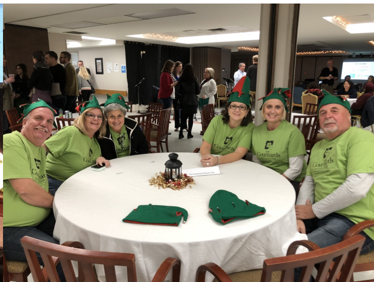
A group from the Courtyards on Eagleson enjoyed our Santa 4 Seniors fundraiser, November 2018. The event attendees, partners, and many generous donors made the purchase and delivery of 320 gifts to isolated seniors in our community possible!