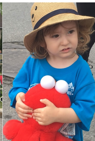
Above—Some of our energetic walkers and cheerers who participated in the Ottawa Race Weekend Fundraiser, 2018!