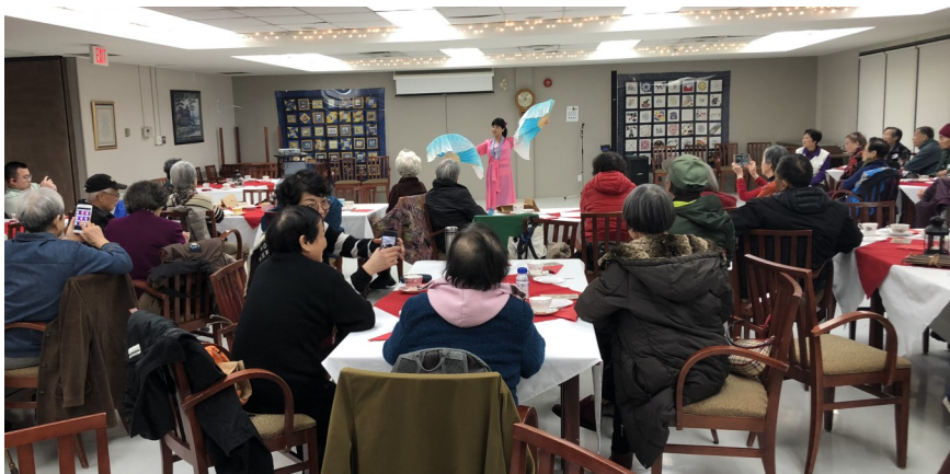
A special gathering was held November 2, 2018, for Chinese seniors including socialization, traditional dance and refreshments. This event was made possible by a grant from the Ottawa Community Foundation.