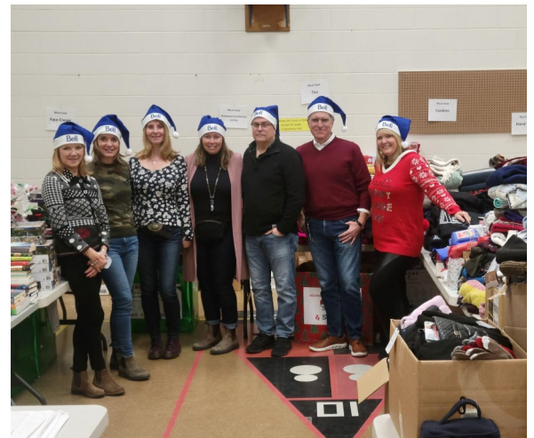
Volunteers from Bell Canada graciously joined us for a full day of sorting and packing presents for our Santa 4 Seniors initiative!