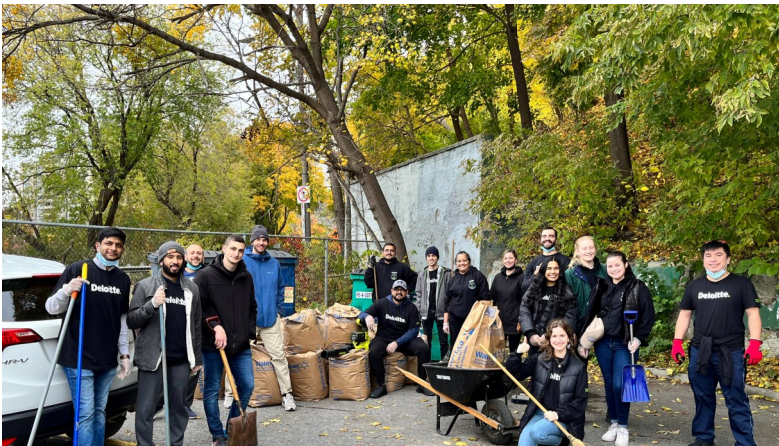
50 volunteers from Deloitte spent the day with TGC in October 2022 to clean our outdoor space, repaint parts of the Centre and even set up our new electronic sign-in system now used at the front entrance!

The heart of a volunteer is never measured in size, but by the depth of the commitment to make a difference in the lives of others."