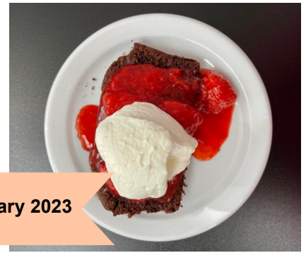
Valentine's Tea, February 2023