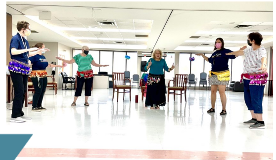
Seniors Active Living Fair and Open House September 2022