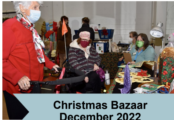
Christmas Bazaar December 2022