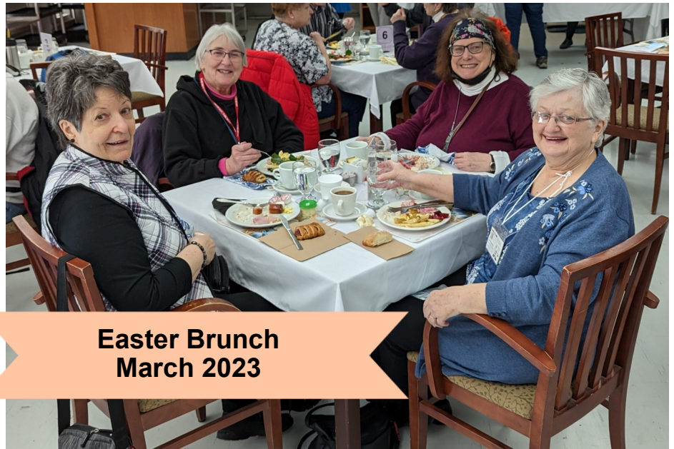
Easter Brunch March 2023