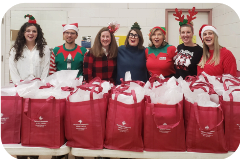
Giant Tiger Santa 4 Seniors

We also saw connection extend outward through shared action. As one example among many, members and volunteers took part in a donation drive supporting Highjinx, a local community hub rooted in neighbour-to-neighbour support. Alongside this, we continued hands-on programming such as crafting milk bag mats - woven from recycled plastic milk bags into durable sleeping mats that provide practical bedding and are used in care and outreach settings across the community. We can do so much beyond our walls. We can!