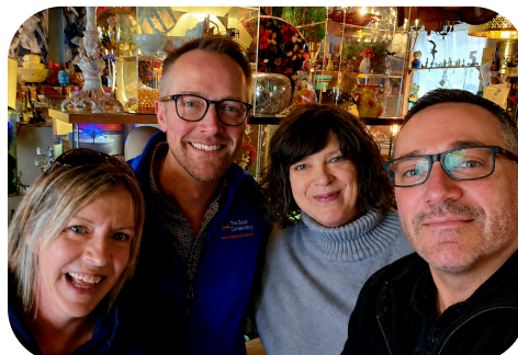
Highjinx Emergency Community Furniture Bank Drive