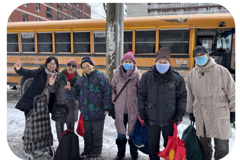
T&T Grocery Trip